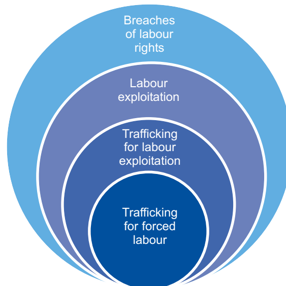
Figure 2: Different forms of labour rights breaches culminating in trafficking for forced labour

Figure 2 shows that of the many forms of breaches of labour rights in the labour market, some can be considered as labour exploitation. Once people are recruited, by fraudulent or deceptive means for the purpose of exploiting their labour, the act may then be classified as trafficking for the purpose of labour exploitation. In certain cases, trafficking for labour exploitation can amount to trafficking for the purpose of forced labour. It should be noted here that both labour exploitation and forced labour could take place in conjunction with trafficking, but also without it.