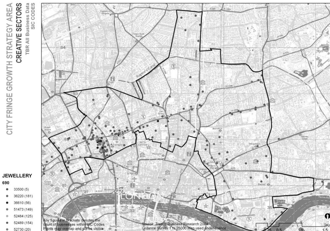
Figure 2. Jewellery Firms in the City Fringe

for the UK jewellery industry and for diamonds in particular. Also present in the area are a number of colleges and providers of specialist support to the cluster.