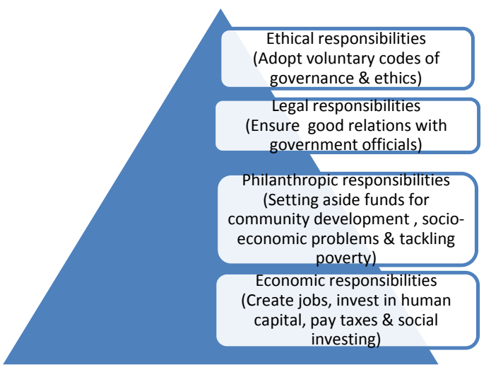
Fig. 3. African-centred CSR

Consequently, this study will leverage Visser's (2006) Africa's CSR Pyramid model, which emphasizes that in Africa (Nigeria) economic responsibilities still get the most emphasis (Visser, 2006). Nevertheless, philanthropy is given second-highest priority, and subsequently legal and then ethical responsibilities (see Figure 3).