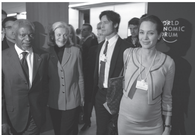
Figure 6.2 Former United Nations Secretary General Kofi Annan links up with 'Brangelina' at the World Economic Forum