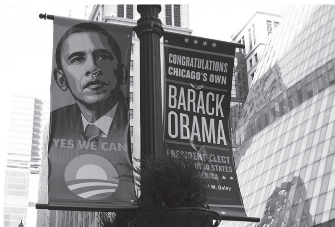
Figure 4.1 Yes we can: Chicago uses Shepard Fairey 'Hope' poster to congratulate its most famous adopted son

designed by artist Shepard Fairey (Alexander 2010a: 68; Kellner 2009: 725). Obama appeared as a visionary leader who could face the troubles confronting America (Redmond 2010: 87). Moreover, he prevailed as he embodied many of the messages he was preaching. For instance, Obama spoke on race in March 2008 to allay fears that the campaign would be framed by racial division and emphasized the common hopes of the nation (Anstead and Straw 2009: 1).