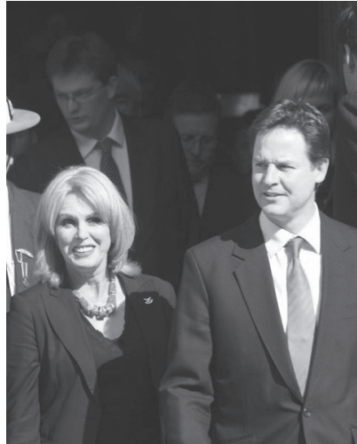
Figure 5.2 Having supported the Gurkhas, Joanna Lumley takes on the Liberal Democrats!

mango chutney with Kashmiri chilli for which ten pence from each jar sold would be donated to the Gurkha Welfare Trust.