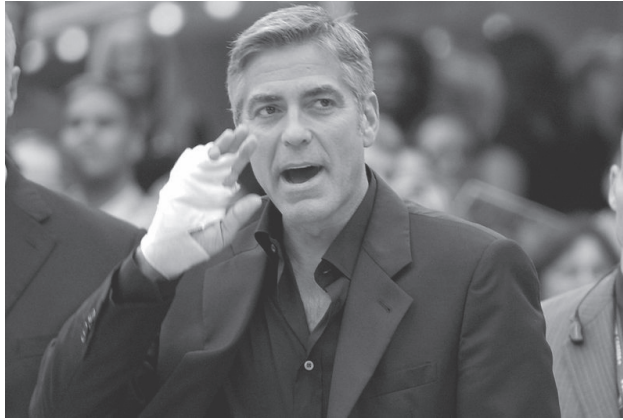
Figure 5.1 George Clooney: Hollywood ‘A-lister’ and its most credible liberal political activist

Nick, a Cincinnati television news anchor, who ran for a Democratic congressional seat in Kentucky in 2004.