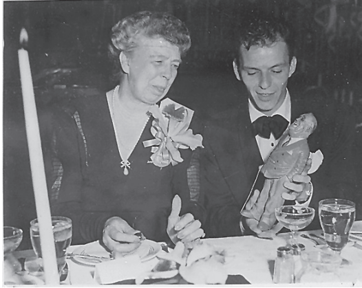
Figure 2.1 'Everything happens to me': Frank Sinatra, 'Franklin D' and Eleanor Roosevelt

E. Y. Harburg, writer of Somewhere over the Rainbow (1939), to orchestrate the songs. Wisely, Corwin interspersed his famous contributors with ordinary voices drawn from a range of workers, farmers and housewives. The show proved to be a triumph and an effective tone was set when Bogart stated: 'This is Humphrey Bogart . . . Personally, I am voting for Franklin D. Roosevelt because I believe he is one of the world's greatest humanitarians: because he's leading our fight against the enemies of a free world' (ibid.: 101).