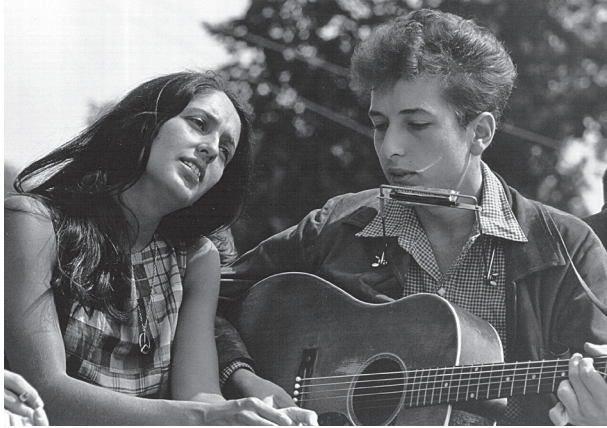
Figure 2.2 'The times they are a-changin': Joan Baez and Bob Dylan as protest performers

performed his song about the white supremacist murder of the civil rights activist Medgar Evers in 'Only a Pawn in Their Game' (1963) at Greenville, Mississippi. The movement reached its peak with the March on Washington in August 1963 in which Baez led 350,000 in 'We Shall Overcome' and Dylan sang several of his songs along with Seeger and Peter, Paul and Mary.