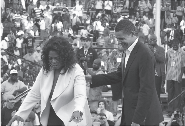
Figure 3.2 Barack Obama lends a helping hand to his most crucial celebrity endorser, Oprah Winfrey