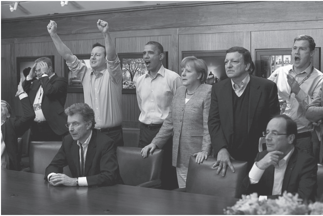
Figure 4.2 ‘Dave’ Cameron versus the ‘Iron Frau’: G20 leaders watching the 2012 Champions League penalty shoot-out

of his upbringing by picking the Jam’s class warrior anthem, Eton Rifles (1979). Cameron had been warned that his open disdain towards Brown during the weekly parliamentary Prime Minister’s Question Time (PMQ) was counterproductive. Inadvertently, it created public sympathy for Brown while Cameron was compared to the infamous public school bully ‘Flashman’ from Tom Brown’s Schooldays (1857). Therefore, he tried to play down his ‘toff’ image, despite stories emerging about his student membership of the exclusive and notorious Oxford University’s Bullingdon Club (Parsons 2008).