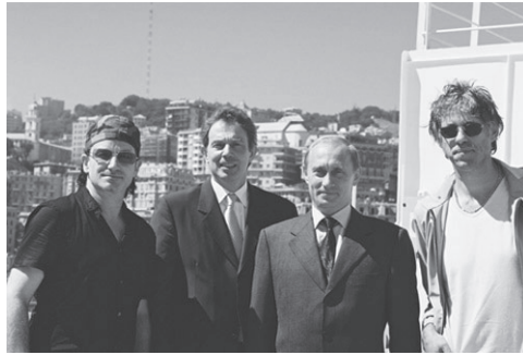
Figure 6.1 'Unexpected bedfellows, that's what we do': Bono, the U2 singer, Blair, Putin and Geldof join forces at the 2001 Genoa World Trade Organization summit

Moreover, a duality has emerged in attitudes to CP2 activity as politicized celebrities have been seen to be either self-interested or populist diluters of complex issues. The lessons of Live Aid and Live 8 were not lost on some of its participatory acts, including Queen, U2, Sting and a reformed Pink Floyd, whose careers, as well as their status, received a vital shot in the arm. As Roger Taylor, the drummer in Queen, noted, their performance revitalized their position as a global rock act in front of an audience of two billion people. U2 became a major international act on the back of their appearance in the globally televised spectacle and their frontman Bono, akin to Geldof, has utilized his fame to break down the barriers between entertainment and global advocacy to become a spokesman on human rights. However, both celebrity activists have been accused of making their causes apolitical, thereby perpetuating a risk-averse approach to the protest movement.