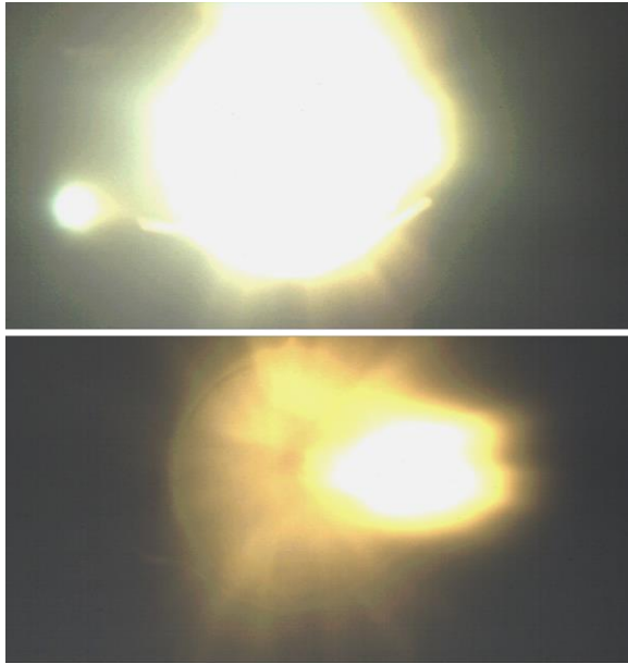
Figure 2: Sequential digital photographs of the ejecta flash from a CO 2 ice target impacted at 4.81 km/s.