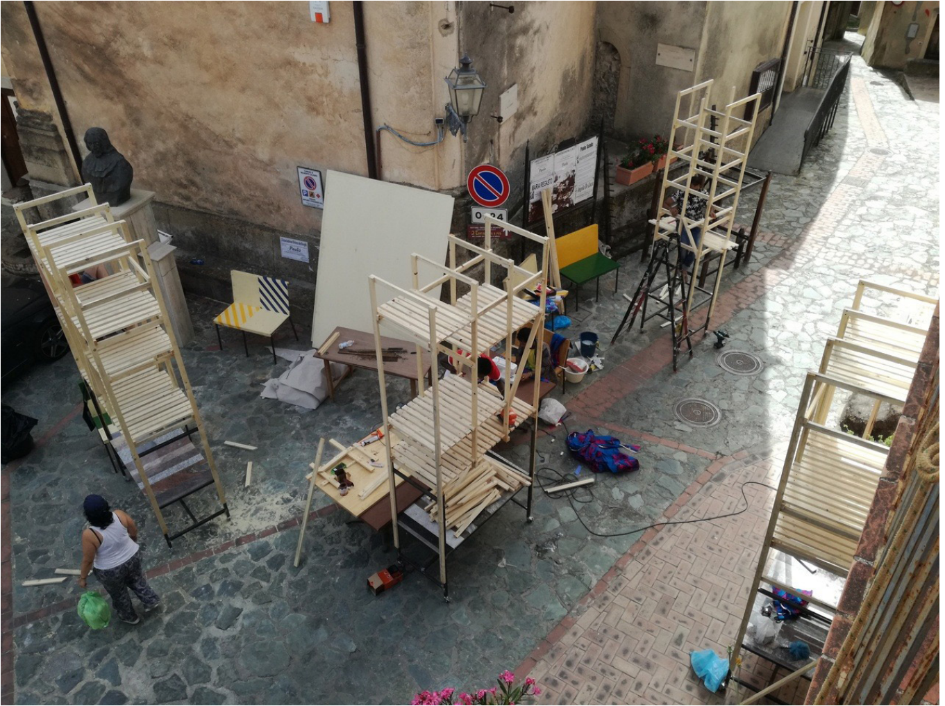
Figure 13: Construction during summer workshop 2018 (Zeshan Mazhar and Silvia Gin 2018).

to Belmonte enables the sharing of everyday life with the locals. The distance and limitation this imposes, enhances the immersion while the specific characteristics of the area become key for achieving successful outcomes. Typically placed in a deprived area to be awakened and transformed through a new vision, Belmonte is open for experimentation. Its underpopulated old town – only about 50 people live there today – offers an openness to new ideas, which we retrospectively realised made the engagement easier than with existing community groups in denser, urban environments.