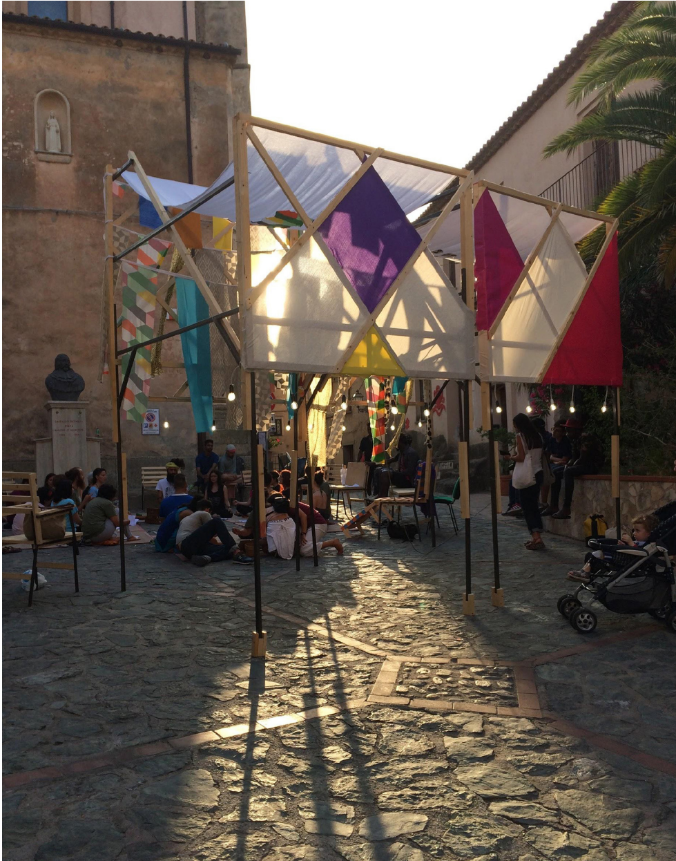
Figure 7: Materialised vision 2017 (Jane McAllister 2017).

Crossing Cultures has shown to have a measurable impact on the village creating interest from academic institutions, local business activity picking up and asylum seekers and refugees entering traineeships. On one occasion, the villagers set up a long community dining table to host a joint eating experience, a follow-up to the community dinners we had organised during our stay (Fig.9). These positive observations are evidence that the long-term engagement in Calabria as a method to drive social change is working towards the integration of newcomers to Italy.