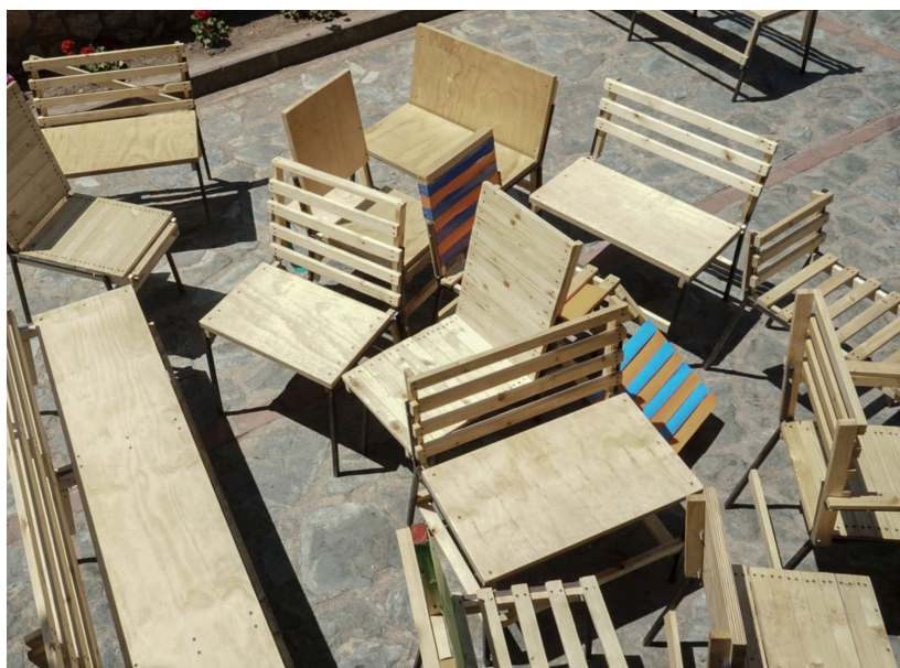
Figure 6: Physical outputs of summer workshop 2017 (Florian Siegel 2017).