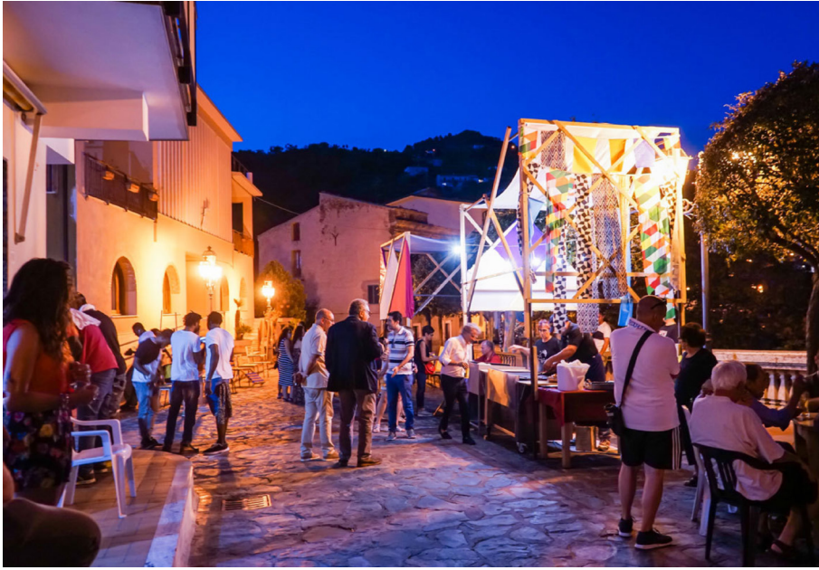
Figure 8: Community dinner during summer workshop (Florian Siegel 2017).