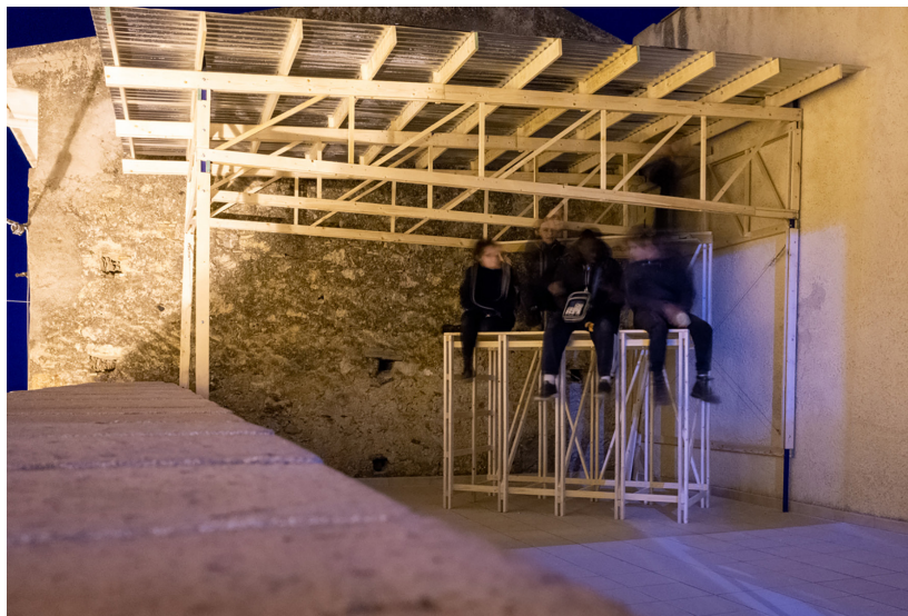
Figure 5: Roof Structure Casa 2020 (London Metropolitan University).