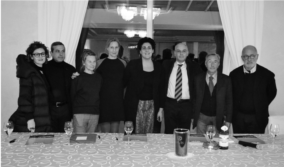
Figure 12: Signing of Memorandum of Understanding.