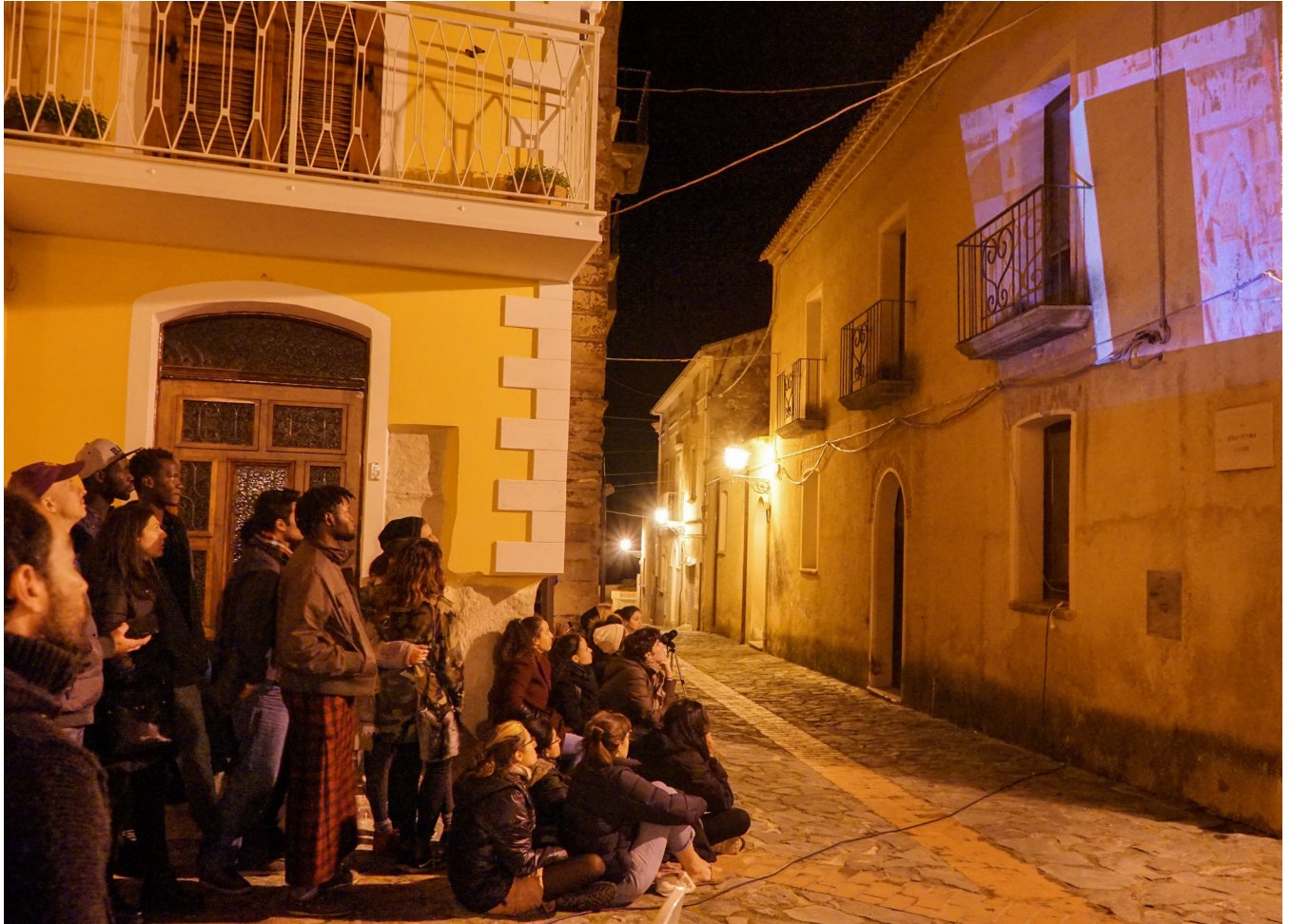
Figure 14: Onsite screening of collaborative films developed by architecture & animation students (Florian Siegel 2017).