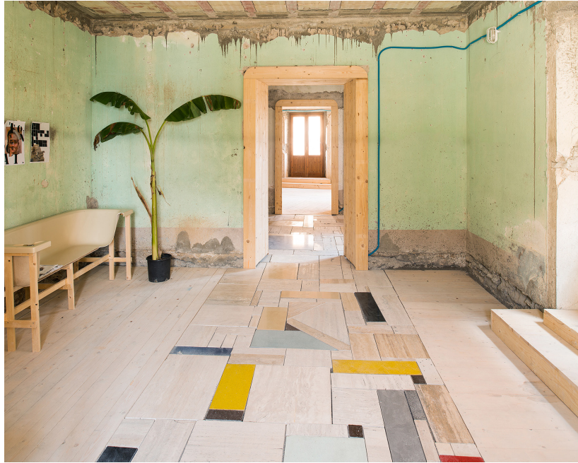
Figure 4: Renovated Casa di Belmondo 2019 (Luca Pitasi 2019).