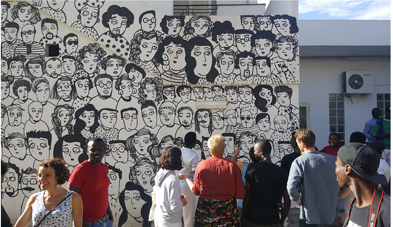
Figure 1: Refugee Centre in Amantea (James Rubio 2016).