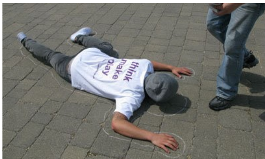
Figure 3: Preparation for The Big Woolwich Text Game, 2009