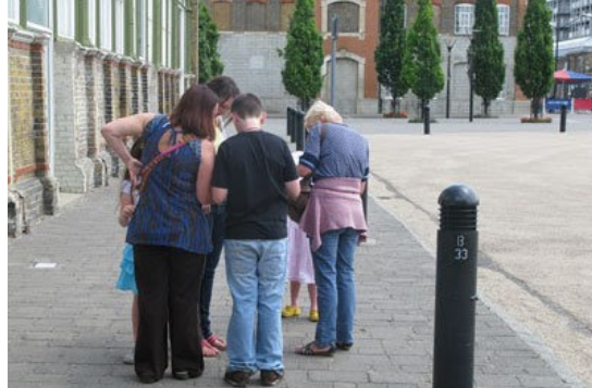
Figure 4: Family check ghostly messages, The Big Woolwich Text Game, 2009