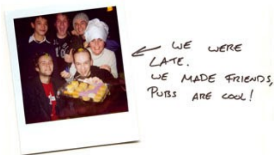
Figure 1: Animals on the Edge, 2003