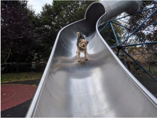
Figure 6: Playing in the park

The goal of bridging generations arises from a growing awareness that elderly people can easily become marginalized and isolated in our communities. The growth of retirement homes and care homes has offered some peaceful housing solutions for older people who may have special needs, but it has also separated them from the wider population. Aiming for inclusivity in game design encourages a tolerant, problem-solving and insightful approach to the discipline, as well as making a philosophical contribution to society by endorsing diversity, solidarity and awareness.