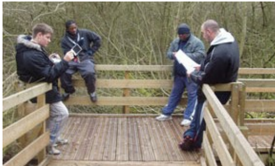
Figure 2: Teenagers from Ponders End Youth Centre in Gunpowder Park, 2003