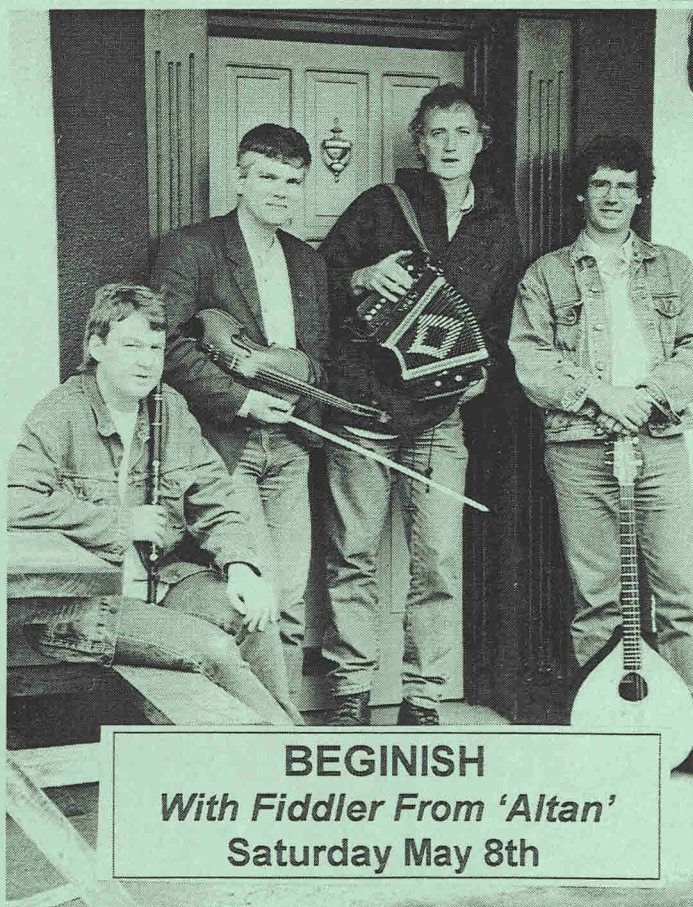
BEGINISH With Fiddler From 'Altan' Saturday May 8th