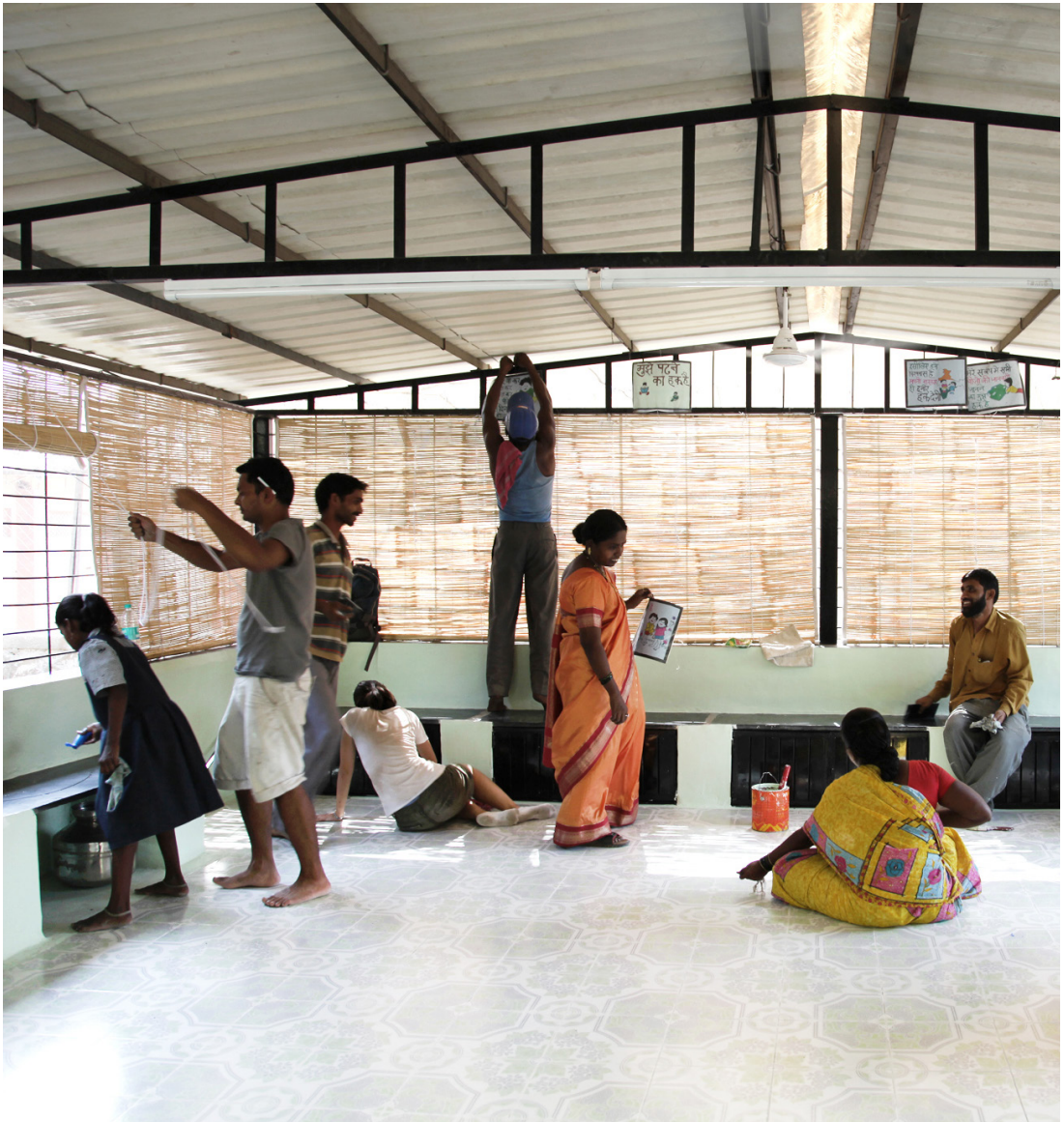
1. Making research through building a classroom, Navi Mumbai, 2010