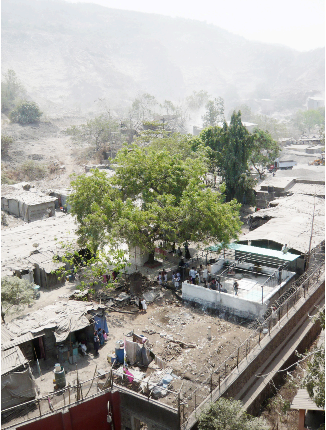
2. View over Baban Seth stone quarry settlement showing the construction of the community classroom, Navi Mumbai, 2009 (Source: Shamoon Patwari).