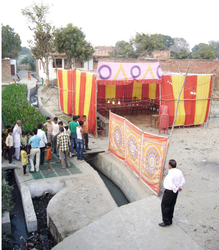
4. Wedding tent erected at the outlet from the DEWATS, Kachhpura, Agra, 2012. (Source: Bo Tang).