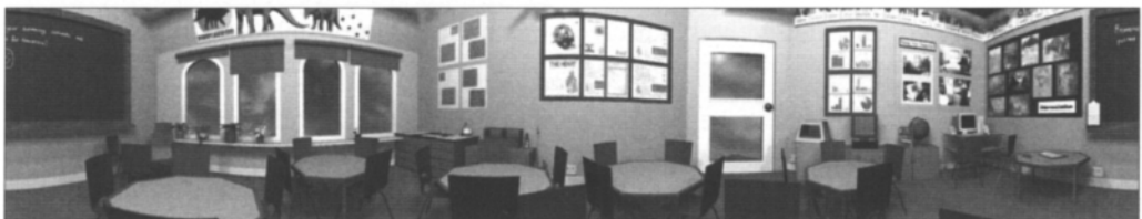
Figure 3: 360 degree panoramic jpeg image.

Our compromise was to build an interactive panorama, a commonly used device for presenting virtual tours of places and buildings. Each space is viewed from a central point with the camera eye seeming to rotate 360 degrees. The user controls the direction and magnification and can move from one panorama to another via hot links. Relevant objects can become hot areas, so that they (in our case, hardware devices) can be clicked to reveal more information. A soundtrack can also be added to each classroom. The panorama is built from a 360 degree flat graphical representation of the classroom (see Figure 3), presented as a HotMedia applet embedded in a Web page.