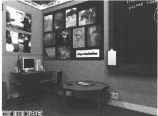
Figure 1: Allsorts Primary classroom.

these people, as well as reading all the paper documentation that relates to their enquiries and is normally found on the premises. Figure 1 shows a snapshot of a classroom in the virtual school.