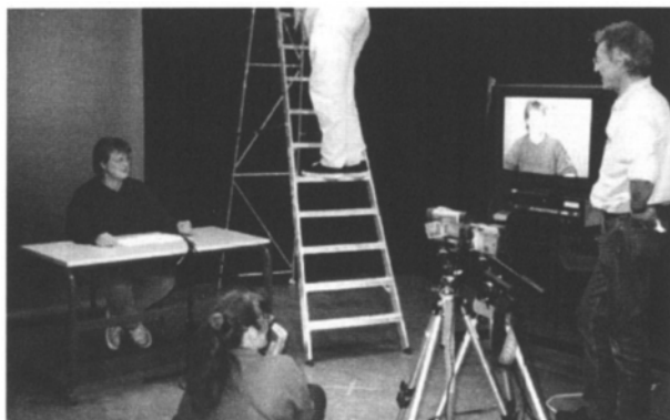
Figure 4: Filming in the television studios.

It was felt that for the sake of realism, the interviews would need to be video, rather than audio presented with a photograph, or animation. Three main technologies dominate Web video delivery – RealMedia, Apple Quicktime and Windows Media. While RealMedia and Quicktime work cross-platform, each requires the purchase and implementation of server software to stream the data effectively. Microsoft’s Windows Streaming Server is free, except that like the others, it uses up the provider’s bandwidth and requires a dedicated machine. Cost will eventually be the over-riding factor, but for our initial prototype we have used RealMedia and Quicktime. The RealPlayer is a standard plugin on most modern computers and can deliver synchronized multimedia integration language (SMIL), which enables a transcript of the teacher’s answer to be delivered in RealText simultaneously with the appropriate video clip. The interview streams and plays in real time. Users can then scroll to different sections to replay.