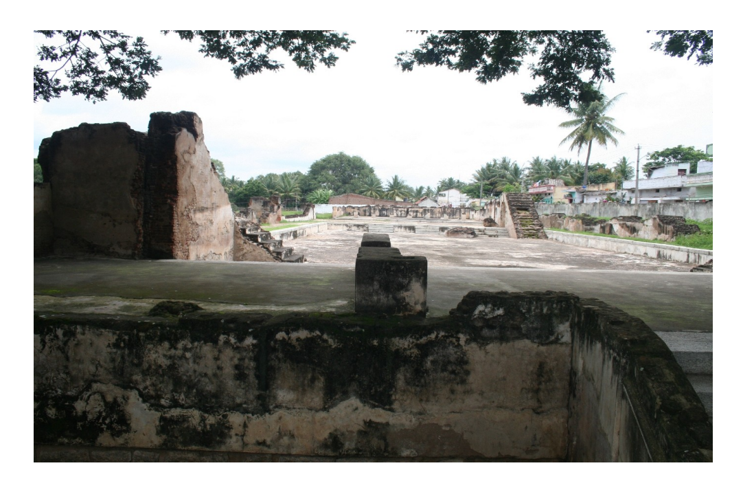
4. Remains of the Lal Mahal palace ('dismantled' by the British troops post Tipu's death)

I asked Sathyanarayana if he could pinpoint when in history did the once-respected devadasi system turn into prostitution , and he said it certainly was not an overnight incident. "From the