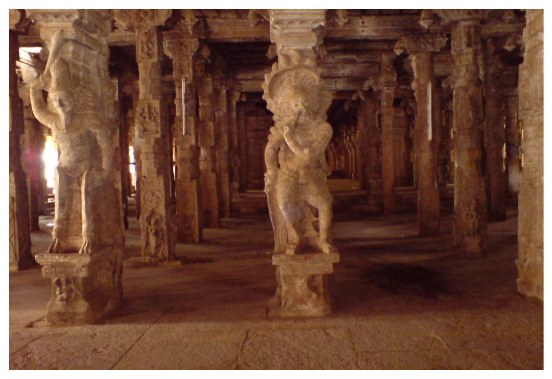
17. The thousand-pillar dance hall, now used as a dining area for devotees