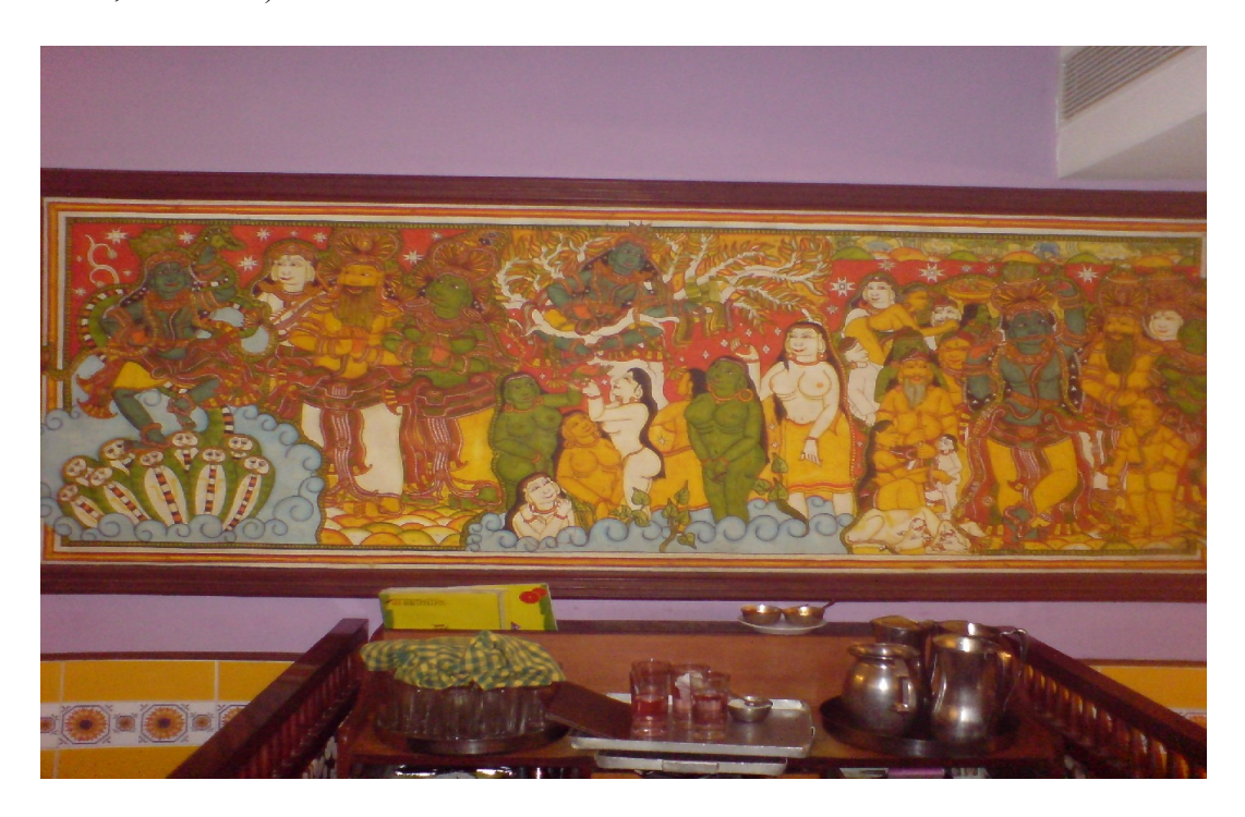
16. An example of temple- chumara-chitram art or kalamezhutu , on display here at a hotel in Kerala

lazy, sloth-like attributes. Green figures will typically represent the gods, red for the demons, and so on).