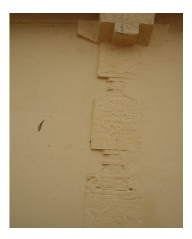
2. Jama Masjid mosque walls beginning to reveal the Hindu temple motifs underneath