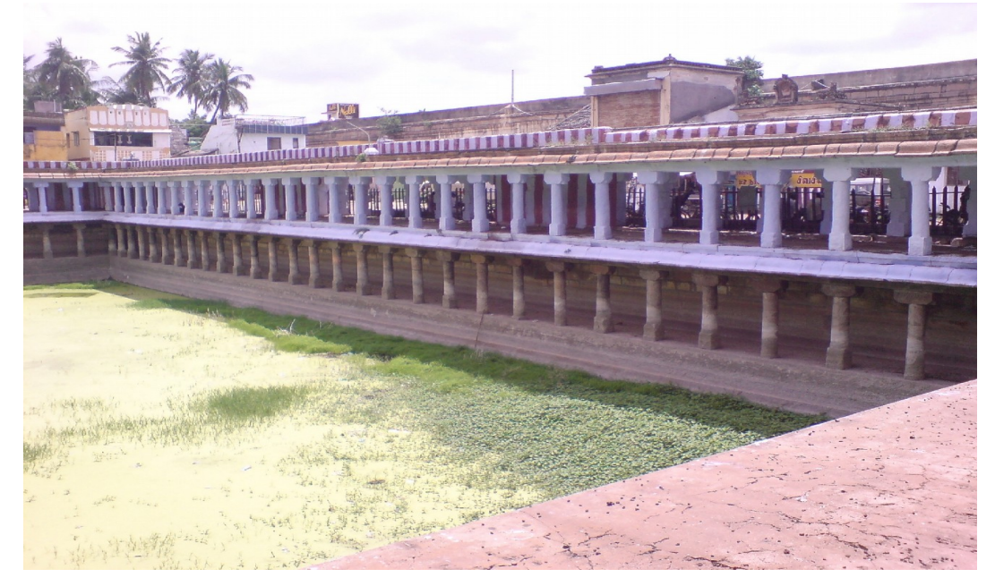
18. View of the now-dried up, square temple-pond and its surrounding corridors