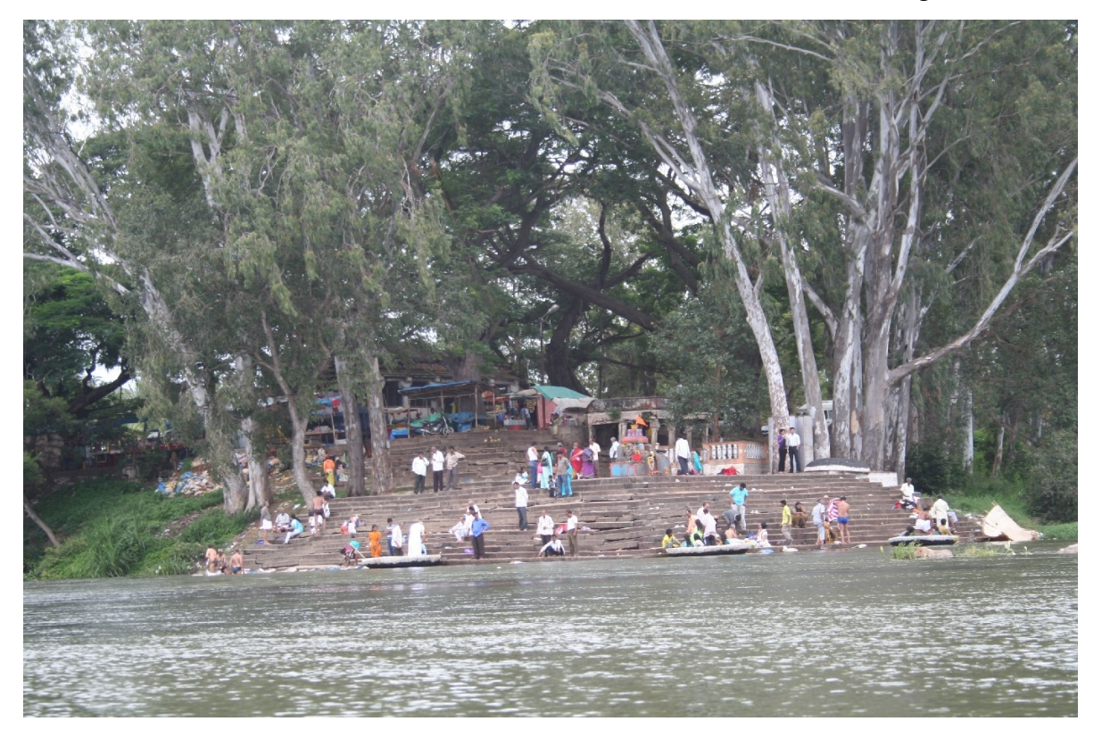
8. View of the steps from the river boat

The small gate to the Lakshmi Narasimha Swamy temple was rusty and creaked open to freshly-mowed lawn and huge, white and maroon striped walls. The small square sanctum, however, was closed and perhaps has been unopened for many years. The silence looming over the statues and the temple, along with the knowledge that something very gruesome had taken place on the ground that we were walking on, covered me in goosebumps from head to toe. This led to my decision to bring the Mandyam Iyengars' massacre to light through the protagonist in the HF, Paarvani.