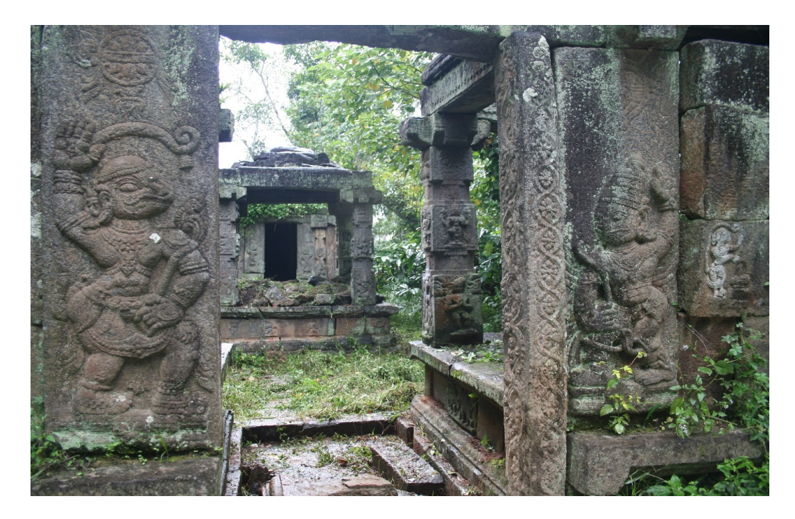
13. Jain temple site at Nadavayal - not yet marked by the ASI; ruined by Tipu's army (likely place where the fictional Thomas - the artist - in the novel, stays for the night with Paarvani hiding close behind)