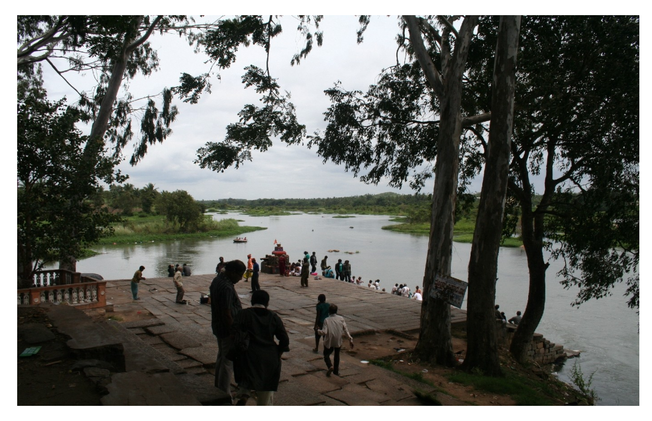
5. Steps leading to the Kaveri Sangam (meeting of two rivers)

On our way out of Srirangapatna, we visited the Kaveri river. The view from the river bank was spectacular and I realised it was exactly how I had imagined it in my book. There were also the huge trees from where the 12-year-old Paarvani would have watched Rati Kumari being bathed by her troupe of servants. The locals use round, tarbottomed boats (like the Welsh 'coracle', only bigger, and without a bench for a seat – you sit cross-legged on the floor of the boat. It seats about six to eight people at a time, including the person/s to row the boat).