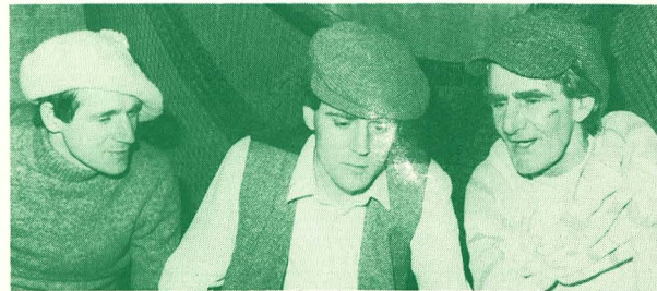
Riders To The Sea

£3.50/concs £2.50/OAPs £1.00 + membership