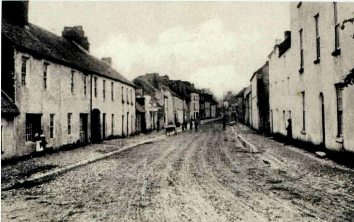
Banagher - Offaly - B/W Main St