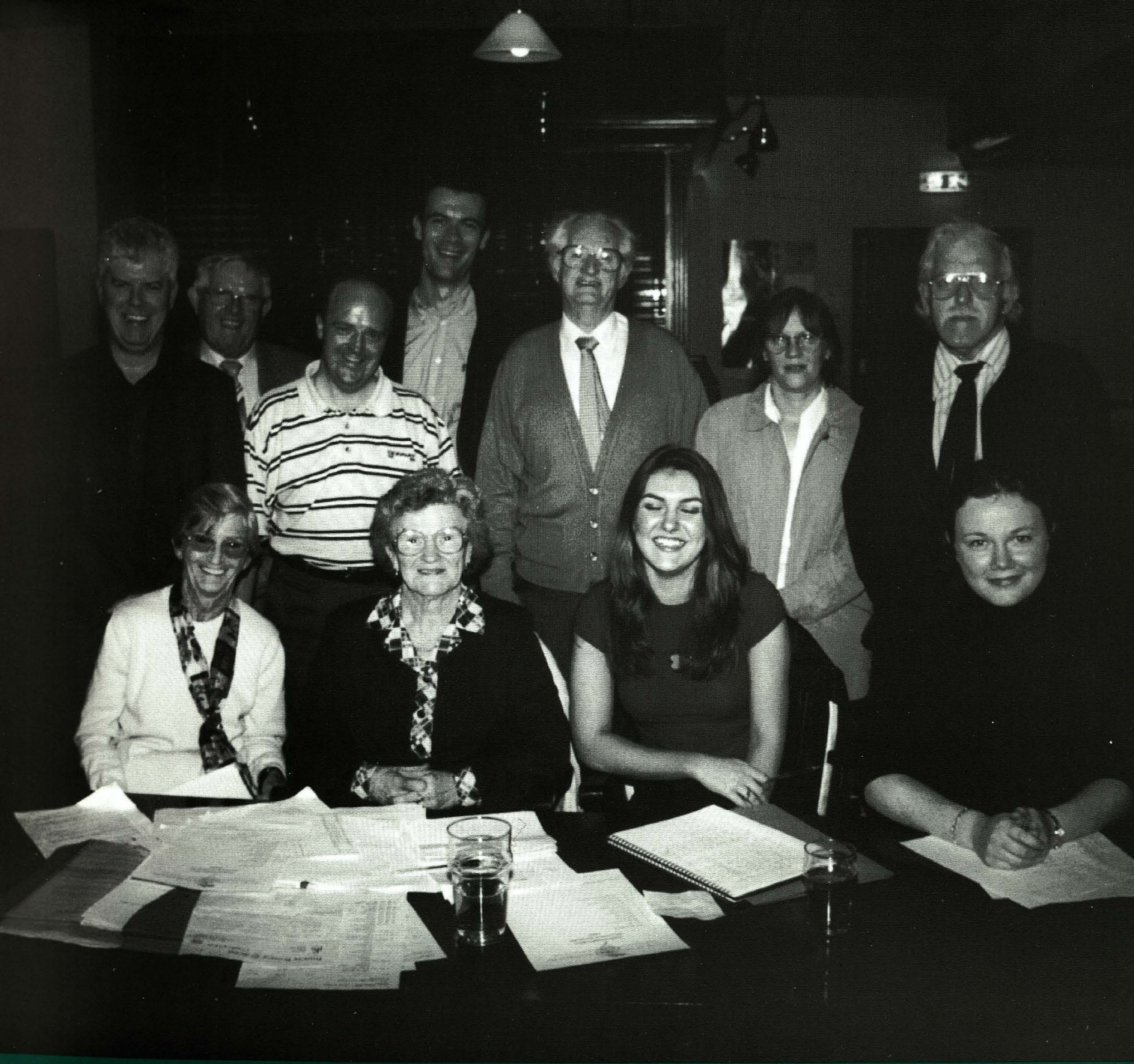
Birmingham 32 Counties Organisation Committee