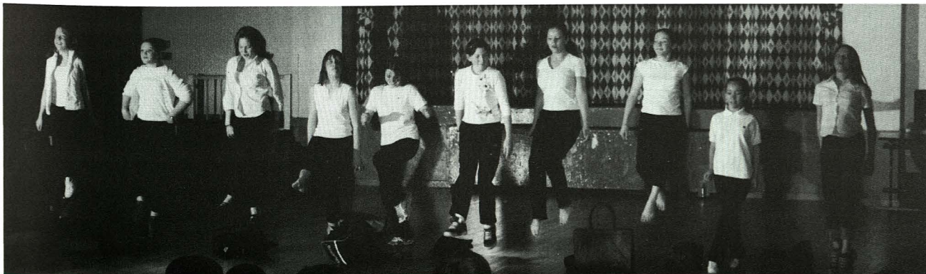
Members of the Irish Youth Theatre Project

CHAIR - BIRMINGHAM IRISH YOUTH COMMITTEE