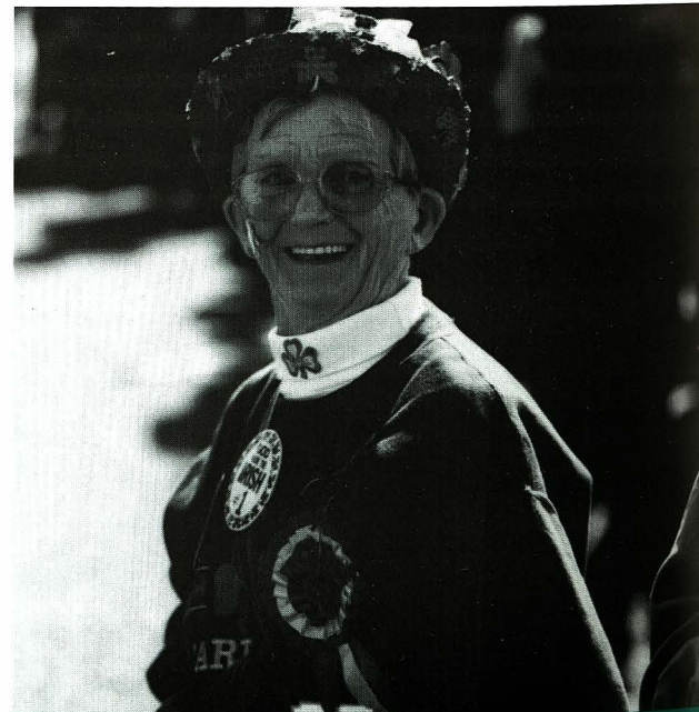
Patsie flies the flag for Carlow

As other St Patrick's Festival events continue through the week we should all raise a glass to them".