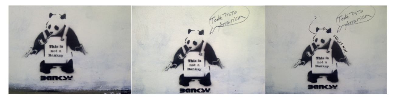
Figure 1. Whymark Avenue, London. April 2013.

Daily longitudinal photo-documentation of the wall allowed us to capture the additions subsequently made to this work by members of the public. Following the next turn proof procedure, we can approach these additions as contributions that show these authors' understandings of the prior works on the wall. The morning after the panda stencil appeared, a passerby scribbled "Take me to America" in a speech bubble above the panda's head (see Frame 2 of Figure 1). This projected speech has particular resonance in the relatively socio-economically deprived context of the neighborhood where the work is located: few local residents would have the means to travel to America. This contribution thus marks Slave Labour's transatlantic journey to an auction house in America as in some sense enviable, but perhaps also out of