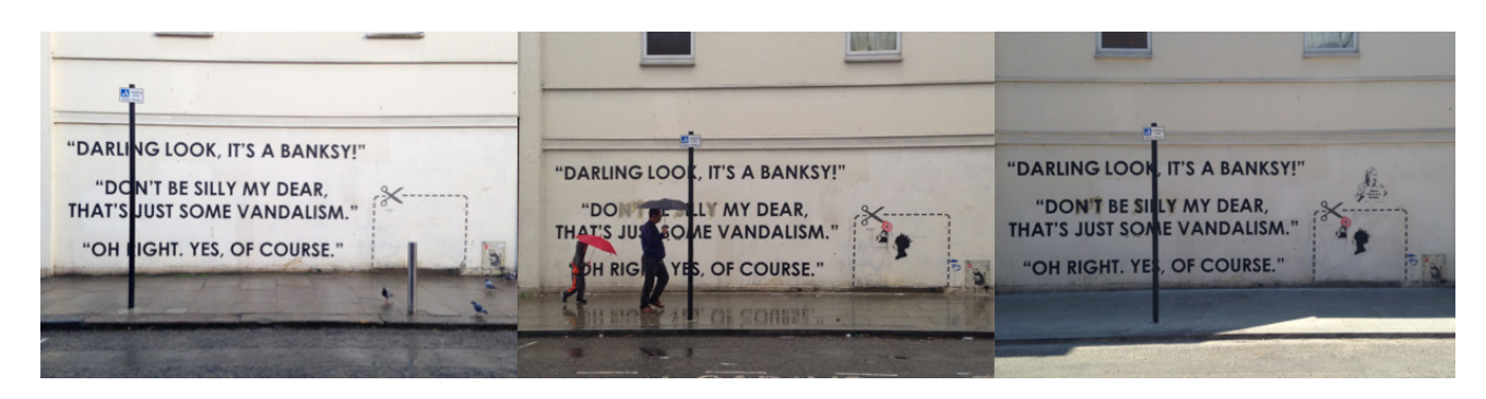
Figure 2. Whymark Avenue, London. May 2014 - April 2015.

tween the panda's ears, mocking its status as a work to be revered; and the block-lettered, "FREE ART NOW!" along the panda's right arm, adopting the format of a political slogan to refer to the wrongfully 'captured' Banksy, and perhaps also to the unethical commodification of street art gifted for 'free' to the community.