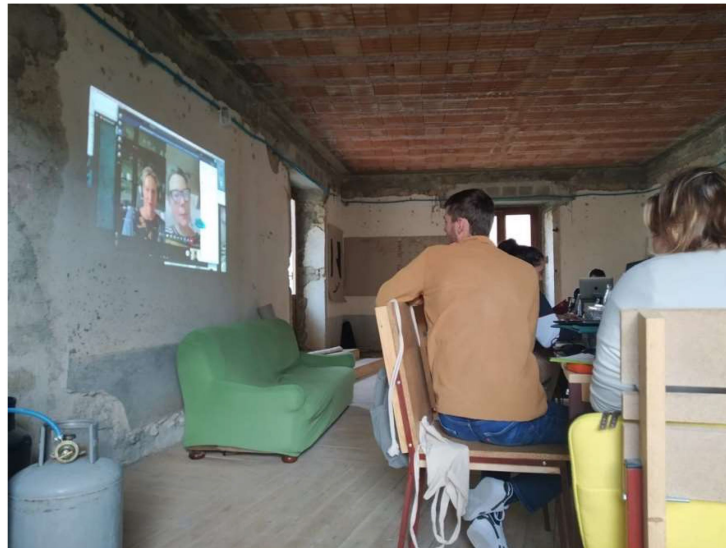
Figure 5. Online teaching in the Casa with tutors from London

Equally important to the positive experience for our students during the pandemic is the fact that the students themselves – by their presence and creative engagement – have added value to Belmonte and the region. If we consider that cultural industries can potentially be initiated through artist-in-residence programmes and become a driver for regional development, then the students from London residing for several months in Belmonte have been a magnet, attracting a creative community of like-minded young Italians to settle in this region. 51 The students involved in Studio South contributed to the reactivation of the village without any organised workshops and certainly helped the economy to grow by increasing this sparse population and enlivening Belmonte with their presence. The vice-mayor, who has previously pointed out that the students' way of thinking about the village is very different to the Italian way of seeing things and that 'the community of Belmonte would not have been able to believe and see things as it can now', 52 recently shared his view on Studio South: 'many municipalities wanted to contact the group because they understood that this type [of experience] can give new life to our villages'. 53