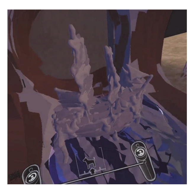
Figure 3: 3D scanned VR model of 'Age of Exploration, Slaves to Silk', 2018 by Fion Gunn.

By creating a virtualised version of the artwork by means of 3D scanner (Figure 3), the opportunity to introduce such elements not only allow the artwork to be presented in a dynamic instance but also avoidance of damage to the artwork thereby changing the parameters of its perception and allow it to be experienced entirely differently. ...Creating a VR environment gives it another story. There's another narrative going on in that work which separates it from the original material artwork." Furthermore, through the process Fion was able to create a 3D model of herself through use of the 3D scanner, which was placed in the virtual model. Through this process artists can portray themselves and their models, as virtual and or visceral characters within the online world. Art can transmit humour and allegory through puns, parody and poetry includes biting social satire, e.g. the artist Carla Gianna's use of an Artificial Intelligence (AI) persona to reflect satire.