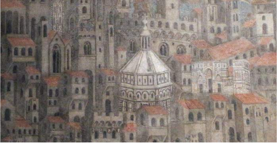
Detail of the Madonna della Misericordia, school of Bernardo Daddi, middle of the fourteenth century, Bigallo, Florence