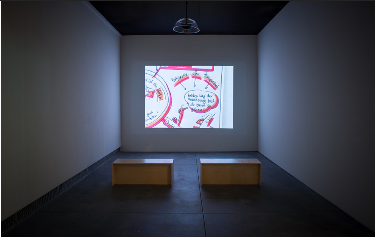
Office Space , installation view of Harun Farocki, A New Product , 2012