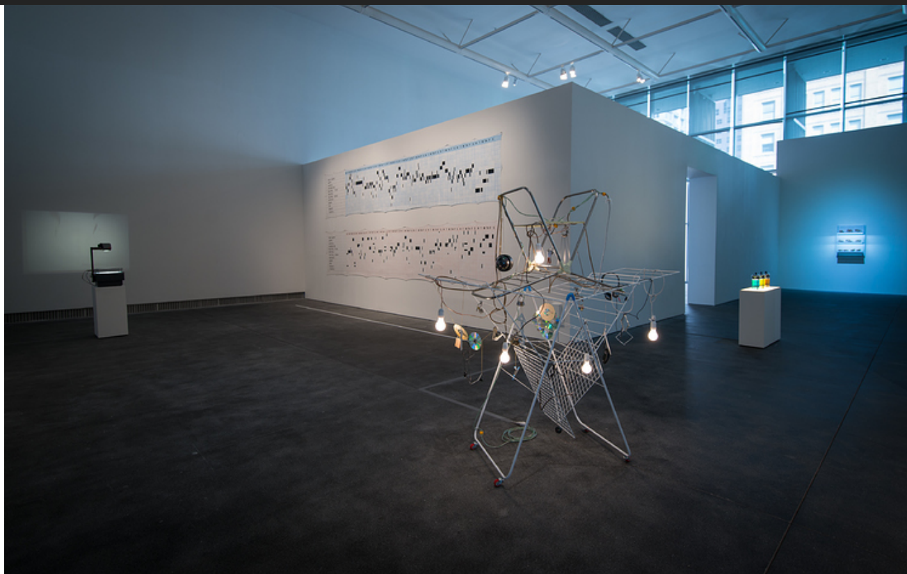
Office Space , installation view, Yerba Buena Center for the Arts, 2015.