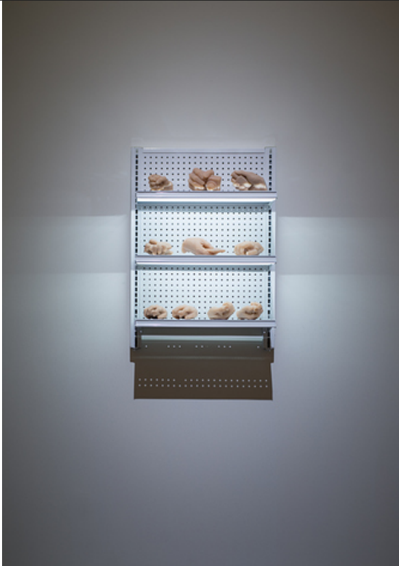
Office Space , installation view of Josh Kline, Creative Hands , 2013