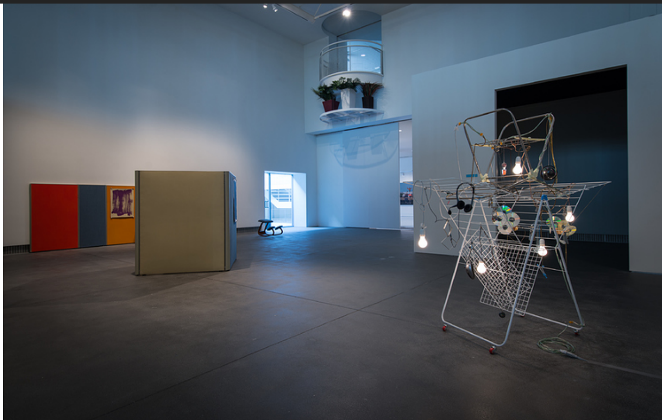
Office Space , installation view, Yerba Buena Center for the Arts, 2015.