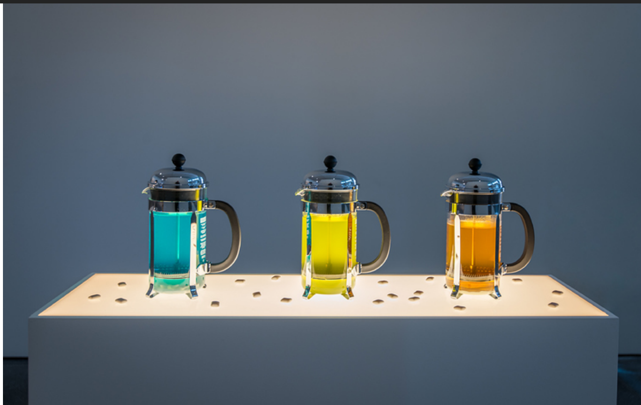
Office Space , installation view of Josh Kline, Coffee co-pays , 2011