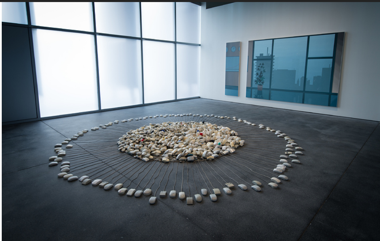
Office Space , installation view, Yerba Buena Center for the Arts, 2015.