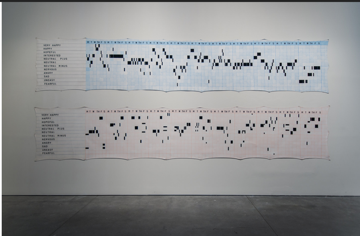
Office Space , installation view of KP Brehmer Seele und Gefühl eines Arbeiters , Whitechapel Version ( Soul and Feelings of a Worker , Whitechapel Version), 1978