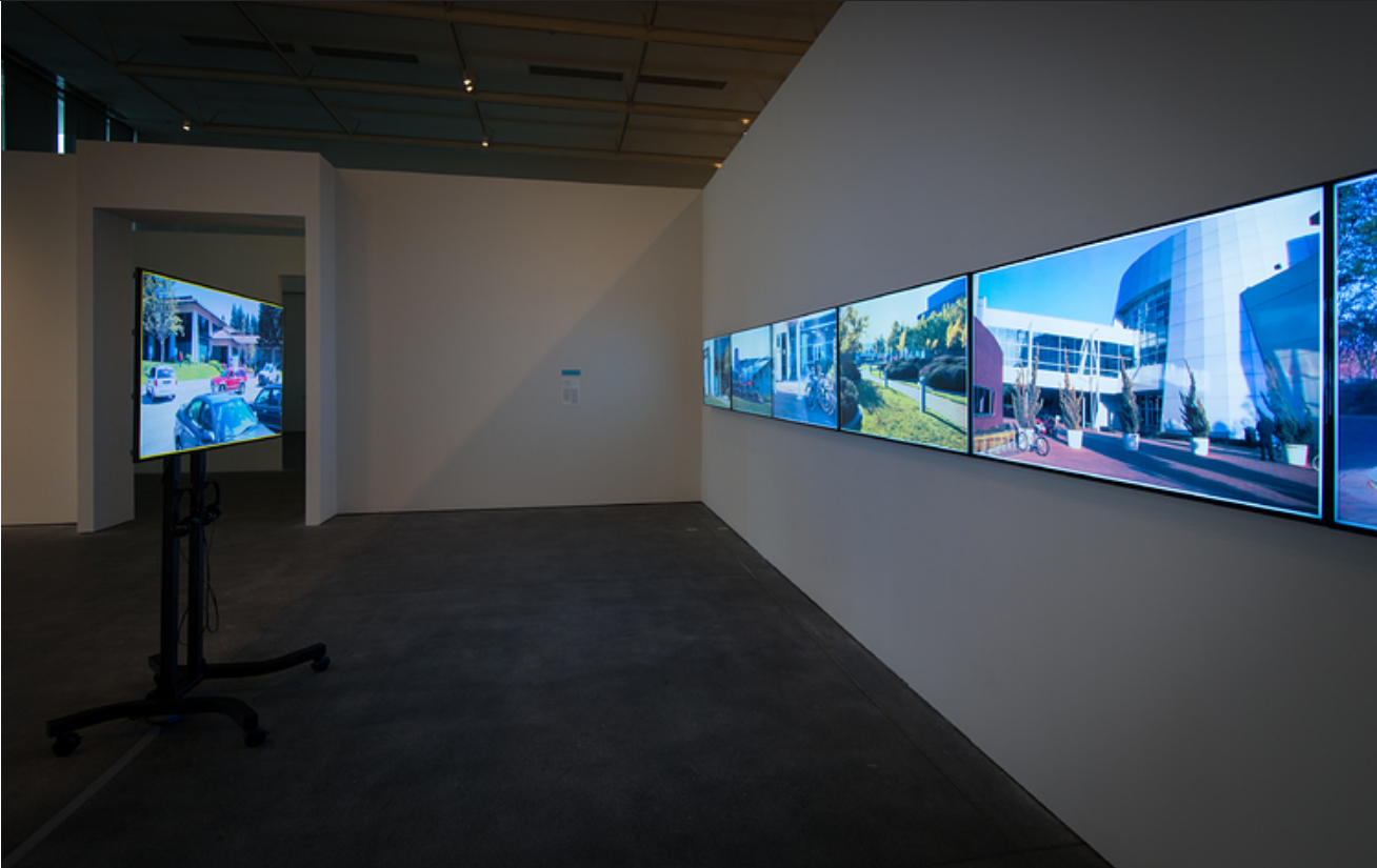
Office Space , installation view of Andrew Norman Wilson, Workers Leaving the Googleplex , 2009-11