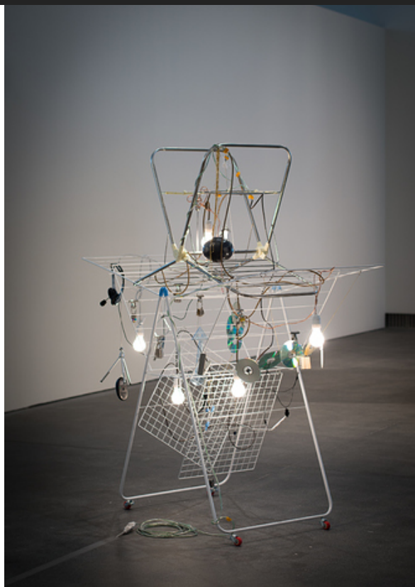
Office Space , installation view of Haegue Yang, Office Voodoo , 2010