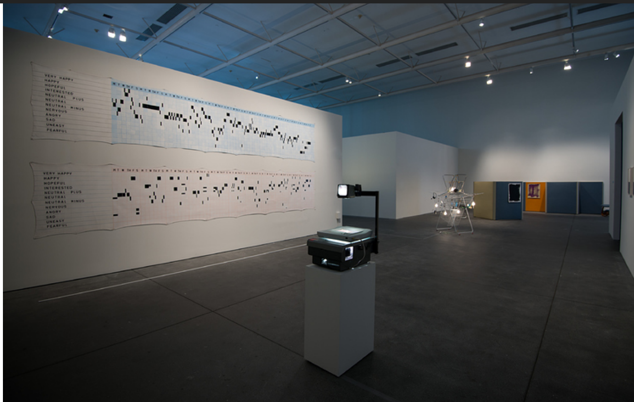
Office Space , installation view, Yerba Buena Center for the Arts, 2015.