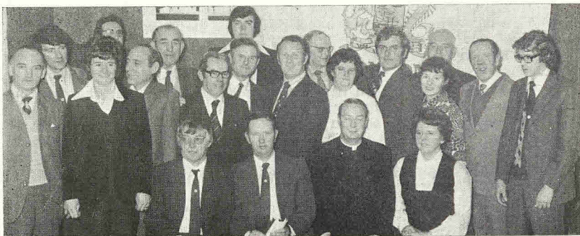
The photograph shows Officers and Committee for 1976