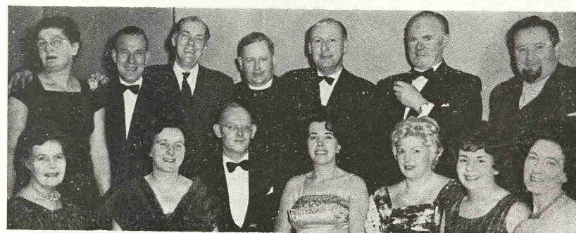
at the Annual Dinner in 1959.