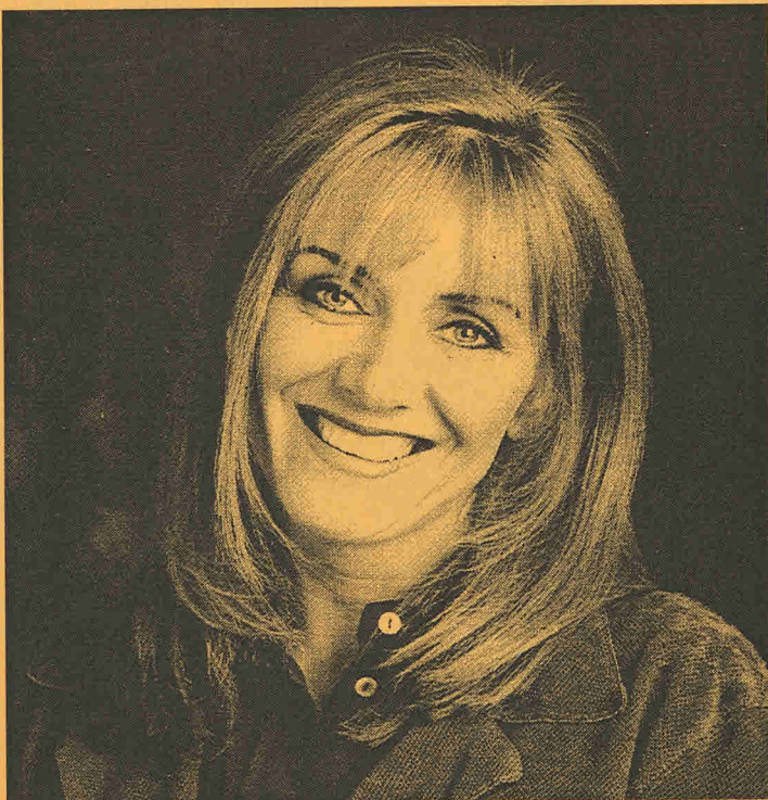
From 'A Woman's Heart' Irish Singer Francis Black Here Fri Dec 15th