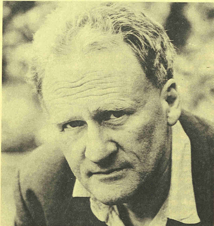
Sat December 4th Ireland's Premiere Poet & Entertainer Paul Durcan

Promoting Irish Arts Culture & Education