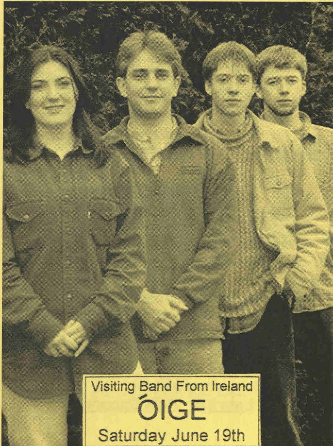
Visiting Band From Ireland ÓIGE Saturday June 19th