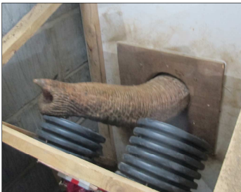
Figure 4: Reaching for pipe buttons through the wall