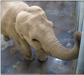
Figure 3: Valli listens to didgeridoo