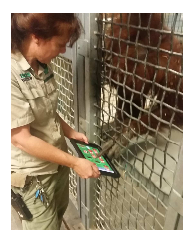
Figure 4 : Malu the Orang-utan playing iPad games designed for humans at Melbourne Zoo.