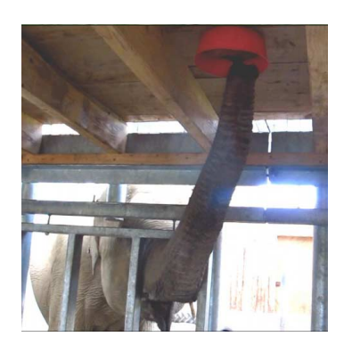
Figure 3 : Co-organizer Mancini & French's digital enrichment for Elephants at Skanda Vale.