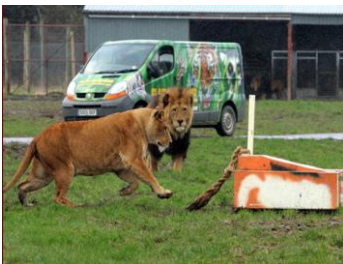
Figures 1-3: Prototypes of Lion Rover, a remote controlled enrichment device for stimulating hunting behaviour in large felids [11], images courtesy MKJ

efforts. In addition, they provide an opportunity for researching species to help their preservation, restoring their natural habitats and related ecosystems.